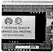
16th IQAC M...